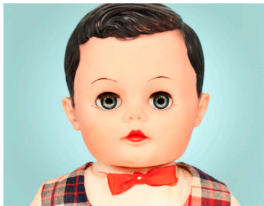
Peter, archival pigment print